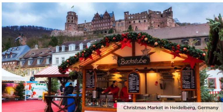
Christmas Market in Heidelberg, Germany