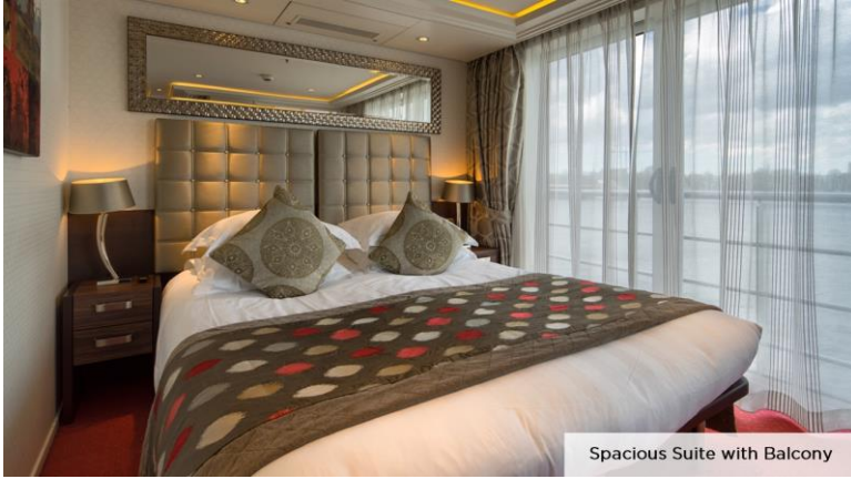
Spacious Suite with Balcony

7-night cruise | December 3-10, 2025 | Aboard AmaPrima