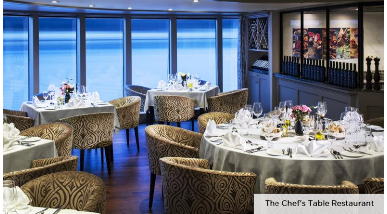
The Chef's Table Restaurant